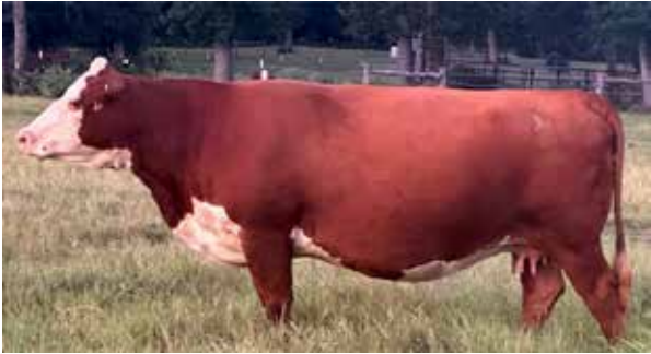
Dam: DJ 100W 1072 Rosey 1505 (43629244)