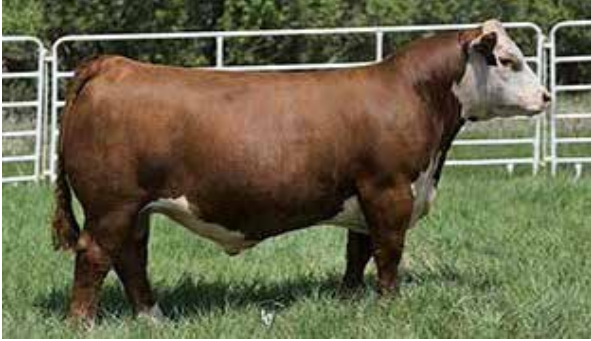
Sire: RST Final Print 0016 (44178105)